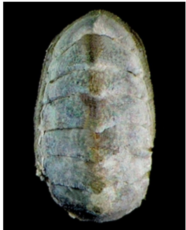
Fig. 3. L. furtiva (3.6 × 1.9 mm).

mediate plates. Dell'Angelo & Forli (1996:43,45) reported that the shape of the valves in this species presents some similarities with the valves of the fossil Pliocene Lepidochitona verrucosa Dell'Angelo & Forli, 1996. L. furtiva lives between the leaves of P. oceanica , a few centimetres above the roots (Strack, 1988).